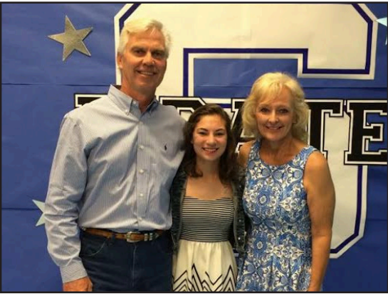
Blue and White Scholarship Winners each received a scholarship for $400