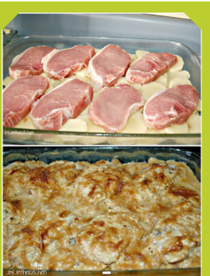
Creamy Pork Chops and Potatoes

Make it a Meal! Serve with buttered corn on the cob (Parade mini cob corn 6ct. on sale 3/$5.00!) and warm buttered rolls to make this a belly-filling meal for the whole family! Recipe found at www.joy-inthekitchen.blogspot.com