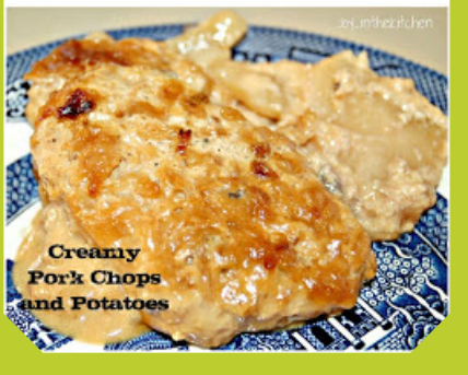
Creamy Pork Chops and Potatoes