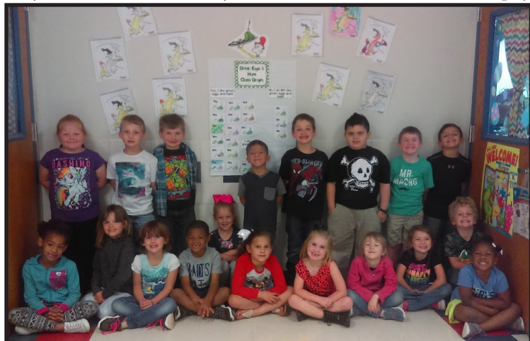
Class graph of Green Eggs and Ham

FREE BBQ Come Out and Join Us April 22, 2017 at the Shepherd Community Center on For a FREE Lunch On Us starting at 11:00 a.m. Chopped/Sliced Beef Sandwich, Chips and a Drink Brought to you by Shepherd Community Outreach Program