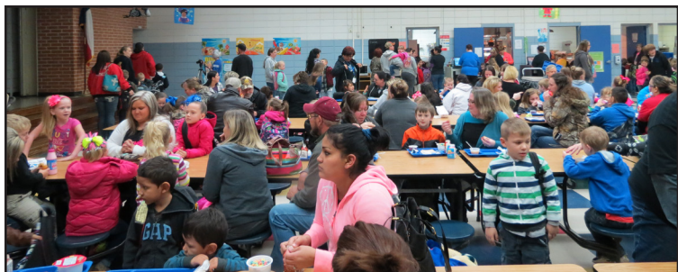
Shepherd Primary held Muffins with Moms on March 5th & 6th. Pre-K through 2nd grade students enjoyed having their moms start the day off by having breakfast with them.