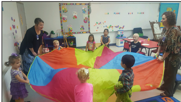
Shepherd Pirateers playing parachute games!

This past semester, Shepherd ISD has had an amazing time in our Pirateers Reading Program! Children ages two to five years old have enjoyed reading books, hands-on activities, craft making, and lots of other fun activities. We will be starting another session of Pirateers on January 10, 2017. The program will be held every Tuesday at 8:00 a.m. at Shepherd Primary School. You do not need to have a child in school to attend, and the program is free to any children ages two to five years old.