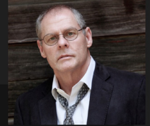
Gerald Crabb Singing & Preaching

10.15.17 10:30 AM 10.15.17 7:00 PM 10.16.17 7:00 PM 10.17.17 7:00 PM